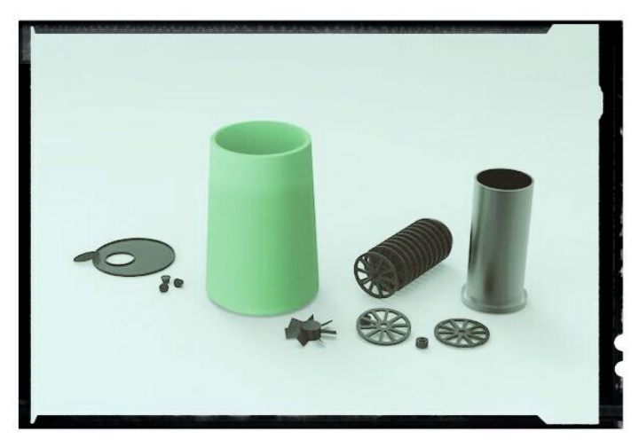
Fig. 2. Parts of cooling pot [1]

For the working of this model I would like to explain the basic structure of the cooling pot. The outer portion of this device is made up of clay and inside it consists of aluminium pipe in which we are having an electric fan and some cooling slices made up of aluminium which is powered by the fan. And it has bolt shape stand at its bottom.