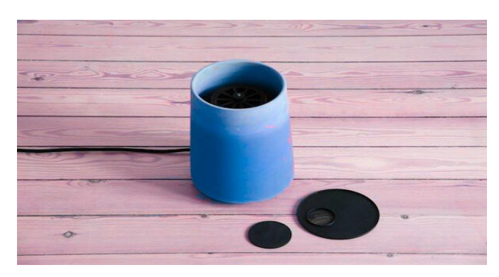
Fig. 1. Cooling pot [1]

the voltage rating of fan). More cooling capacity gives us more benefit that a normal sized room can be easily cooled and a small room can be cooled faster than its earlier speed.